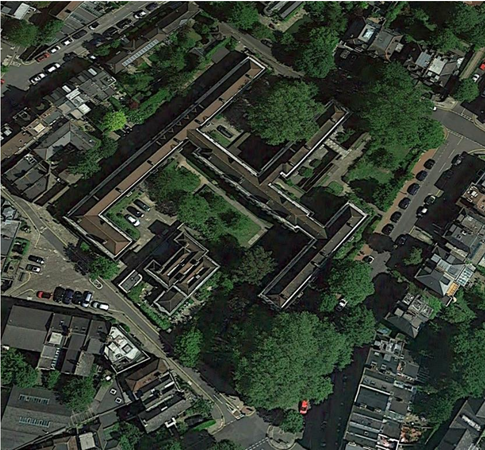
The communal gardens of Wells House and Gertrude Jekyll gardens, winter and summer