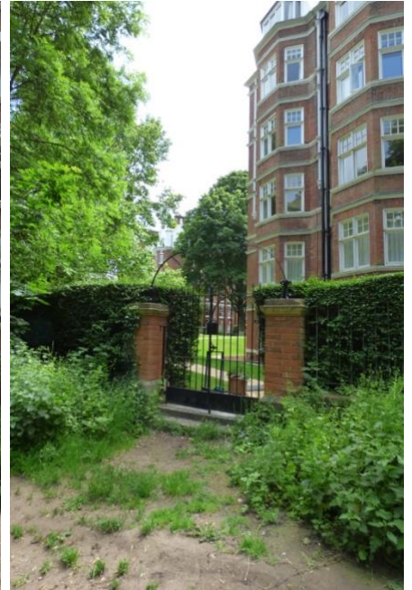
The Pryors photographed from Hampstead Heath, demonstrating how well it blends into its surroundings