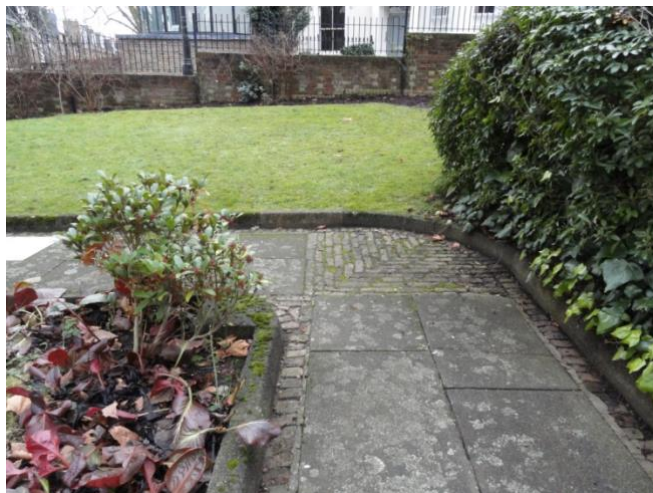
Some of the retained brickwork and materials

Use by Local Community: The flats of Wells House have no private outdoor space; these communal green spaces are residents' sole amenity for children's play, dog walking, gardening and outdoor recreation. Estate residents contribute towards caring for the garden, managed by Camden's Housing district area manager.