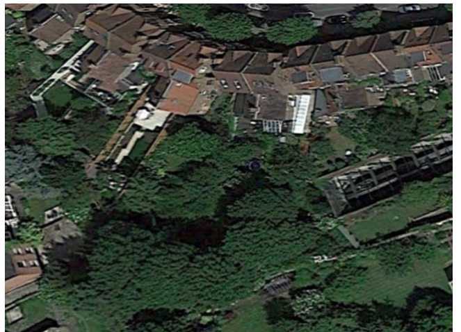
Communal gardens stability over the years as seen with Google Earth: 1999, 2003, 2006, 2010, 2013, 2015