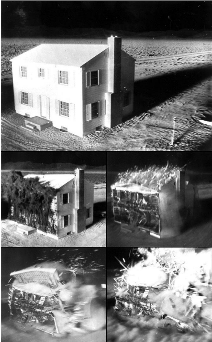
FIGURE 16.1 Stills from footage of Operation Doorstep, showing one of the model houses demolished by a shock wave, 1953.